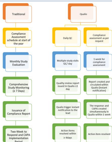
Figure 1. Traditional Paper based workflow.