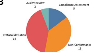
Chart 1. Cumulative number of PD, CA, NCR of 2023 (6 months).