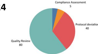
Chart 2. Cumulative number of PD, CA, NCR of 2024 (6 months)